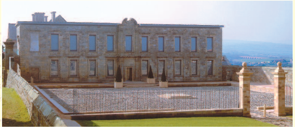
Whitby Abbey Banqueting Hall. Conversion to visitor centre for English Heritage

William Birch & Sons Ltd has completed many projects in the region due to its expertise in working closely with a range of management methods to ensure the highest quality standards. Some past projects include a new-build addition to York National Trust. William Birch & Sons Ltd