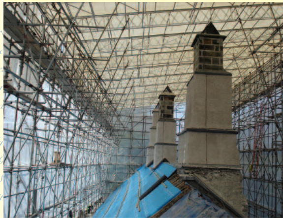
Sizergh Castle roof repairs

The practice has recently been awarded a number of prestigious awards for its work, including winner of the Georgian Group Award for Restoration of a Georgian Church, winners of the Natural Stone Award for use of stone, RIBA Design Award for Blaenavan World Heritage Centre and Civic Trust Award for Wentworth Castle.