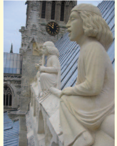
Selby Abbey Stonework conservation and repair

The York Office of Purcell Miller Tritton merged with Martin Stancliffe Architects in 2004; we have now practiced from our offices in Marygate for 25 years. As a practice we specialize in the conservation and repair of historic buildings. Our approach is to provide a professional service to clients and the construction team, a commitment to scholarship and design excellence.