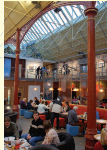
Regeneration of a redundant Grade II* Listed station building to provide new community facilities

The Practice offers a special expertise in the care and regeneration of old buildings.