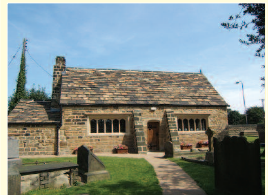
Rescue of a 16th Century School Room from a state of dereliction and near collapse.